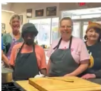
In Home and Community